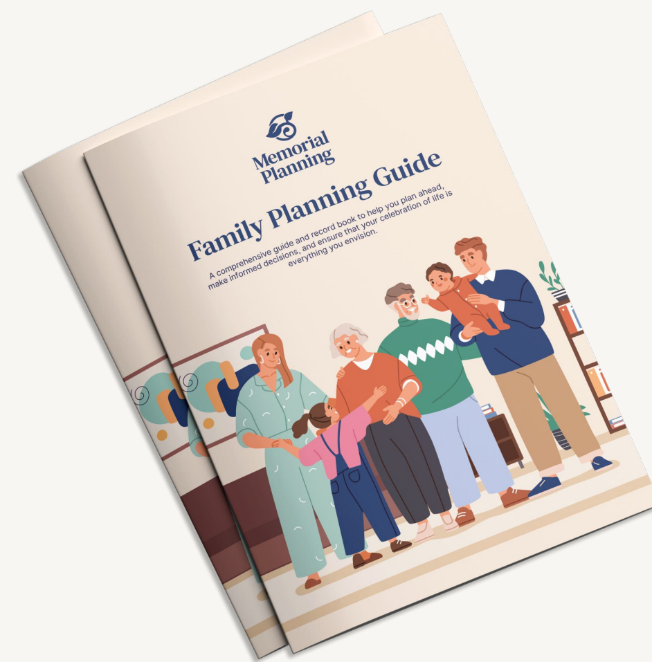
Family planning guide

Our guidebooks offer essential tools to confidently plan your final arrangements, organize key documents, and determine your preferred funeral and end-of-life plans.